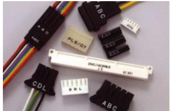
Flat PVC-/plastic components