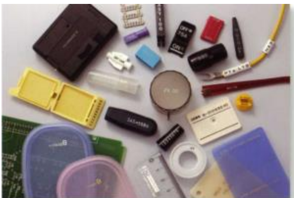
Plastic molded parts