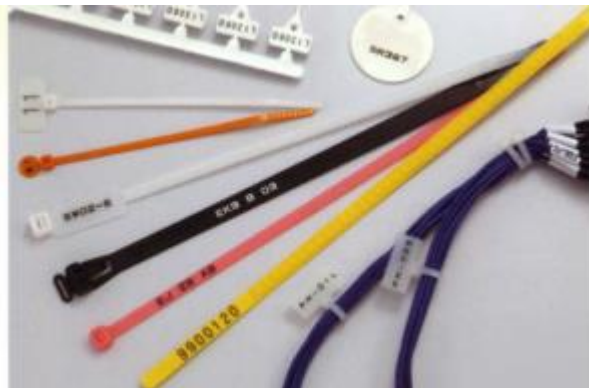
Cable ties (Nylon)